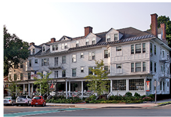
The Red Lion Inn

For more information on The Berkshires , visit Berkshires.org .