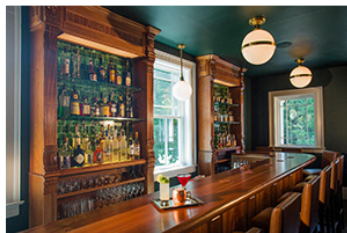
Green Room at Kemble Inn

The Southfield Store Barefoot Contessa author Ina Garten loves the French toast at this little gem in Southfield. Grab a breakfast sammie and off you go to explore the Berks. Also visit sister restaurant Old Inn on The Green, where you want to go for dinner by candlelight and locally-sourced food. It's also a highly-rated bed and breakfast. Info: southfieldstore.com .