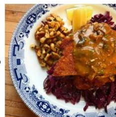
Dining at The Red Lion Inn