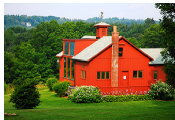
Norman Rockwell's Studio

The Norman Rockwell Museum The illustrator, painter and author lived and worked on the grounds in Stockbridge, with pretty vistas, including gardens; sculptures created by Norman Rockwell's son Peter; and apple trees planted for each Rockwell grandchild. Of course, it is also home to the world's largest collection of Rockwell art. A prime picnicking spot and you can also visit Rockwell's studio where he worked while living here. Info: nrm.org .